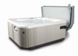
'Cover Mate I' Lifter