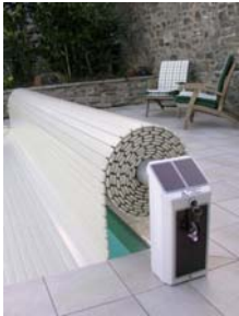
DEL Solar unit