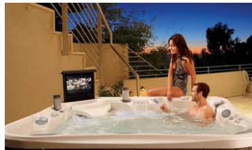
Marquis Spa 'E-Suite'