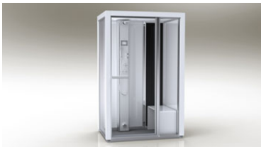
Tylö 'Impression' Mono